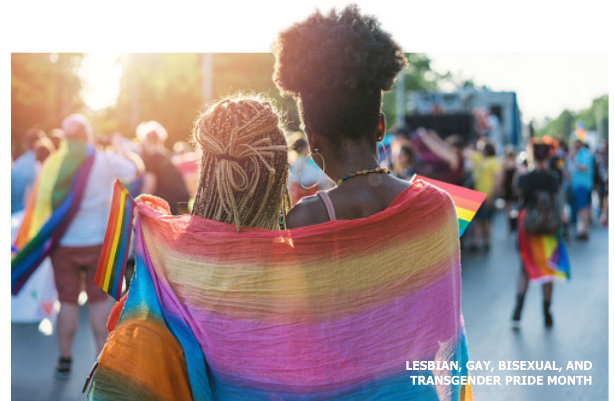
LESBIAN, GAY, BISEXUAL, AND TRANSGENDER PRIDE MONTH

June is Lesbian, Gay, Bisexual, and Transgender Pride Month , established to recognize the impact that gay, lesbian, bisexual and transgender individuals have had on the world. LGBT groups celebrate this special time with pride parades, picnics, parties, memorials for those lost to hate crimes and HIV/AIDS, and other group gatherings. The last Sunday in June is Gay Pride Day.